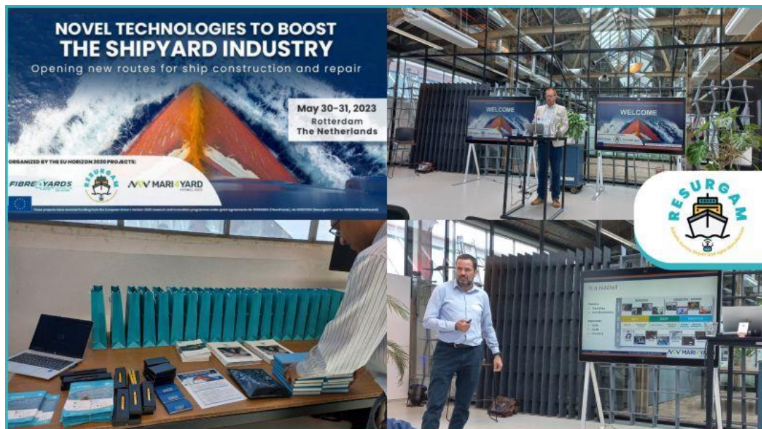
Figure 3 - Joint event