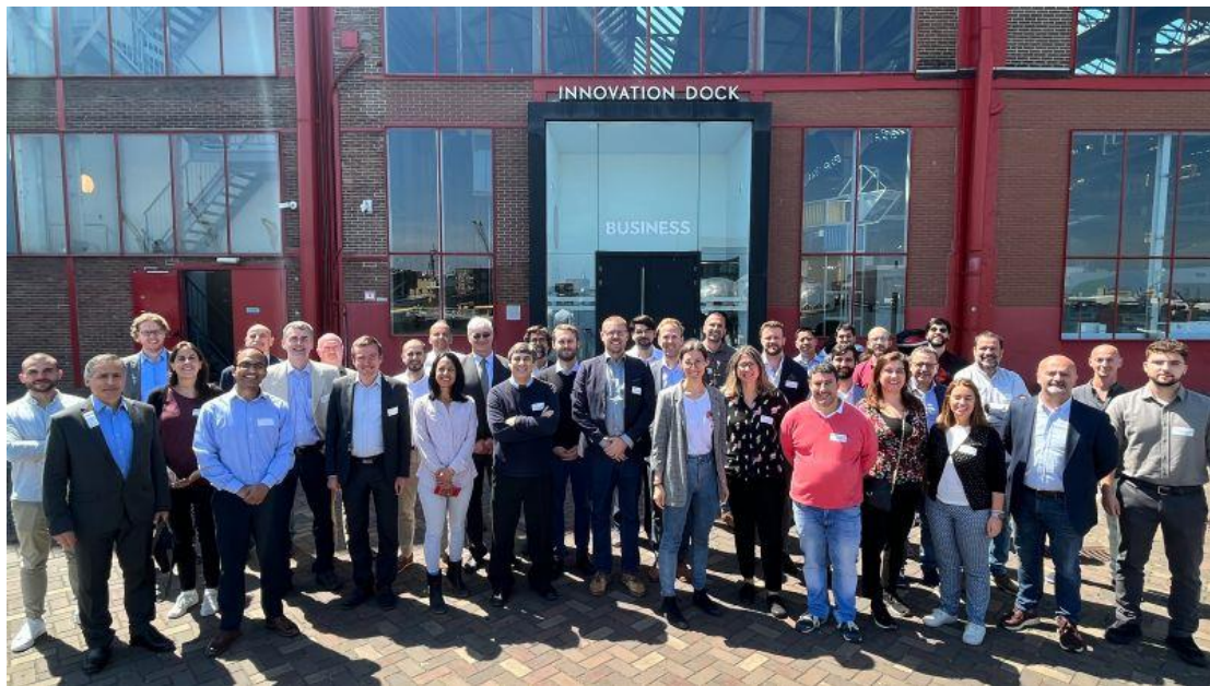
Figure 4 - Participants from sister projects at joint event

Collaborative initiatives between these sister projects offered a multitude of benefits, fostering a dynamic environment that promotes knowledge exchange, synergy, and innovation. Regular meetings served as crucial forums for project teams to share insights, discuss challenges, and align our efforts. These interactions facilitate a deeper understanding of each project's goals and methodologies, paving the way for the identification of common interests and opportunities for collaboration. Through consistent communication, project teams could pool resources, avoid duplicative efforts, and leverage each other's strengths, ultimately enhancing the overall efficiency and impact of our collective endeavours.